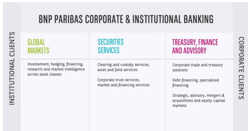
Graph 1: Corporate Structure (Source: Website of BNP Paribas)

BNP Paribas organizes its business into two main fields of activity: Retail Banking & Services (RBS), and Corporate Institutional Banking (CIB). The RBS business is divided into “Domestic Markets” and “International Financial Services”. The other business field, CIB, is a global provider of financial solutions to corporate and institutional clients. The main business activities in the CIB are as follows: